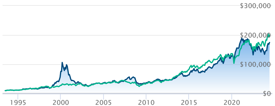
AGF U.S. Small-Mid Cap Fund Mutual Fund Series Dow Jones U.S. Small-Cap TR Index (C$)

The information contained on this page is related only to the designated fund or funds shown above. As part of a BMO Life Assurance Company policy, you do not purchase units in this designated fund or a legal interest in any security.