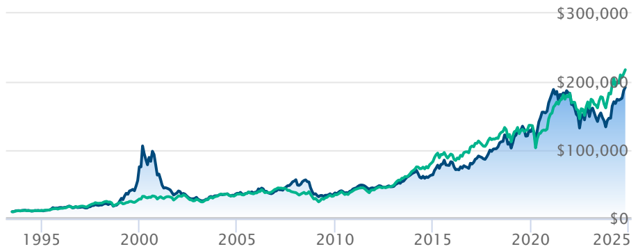
AGF U.S. Small-Mid Cap Fund Mutual Fund Series Dow Jones U.S. Small-Cap TR Index (C$)

The information contained on this page is related only to the designated fund or funds shown above. As part of a BMO Life Assurance Company policy, you do not purchase units in this designated fund or a legal interest in any security.