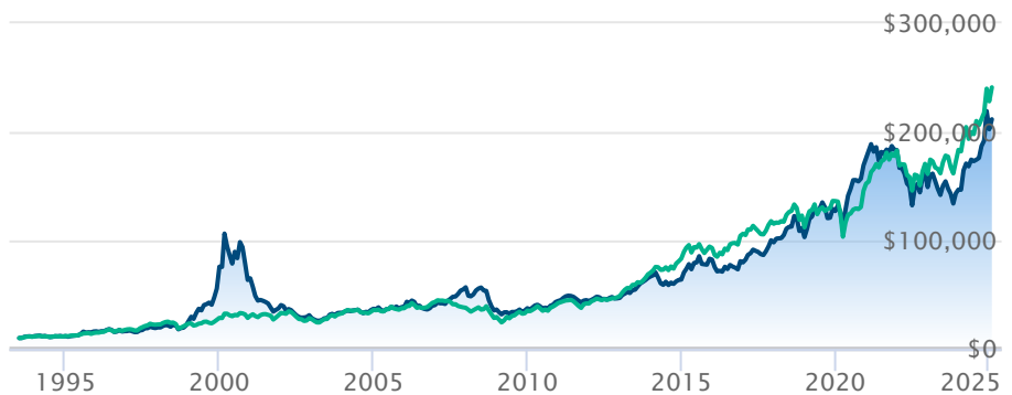
AGF U.S. Small-Mid Cap Fund Mutual Fund Series Dow Jones U.S. Small-Cap TR Index (C$)

The information contained on this page is related only to the designated fund or funds shown above. As part of a BMO Life Assurance Company policy, you do not purchase units in this designated fund or a legal interest in any security.