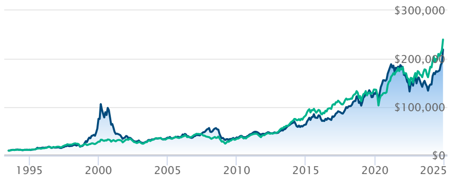
AGF U.S. Small-Mid Cap Fund Mutual Fund Series Dow Jones U.S. Small-Cap TR Index (C$)

The information contained on this page is related only to the designated fund or funds shown above. As part of a BMO Life Assurance Company policy, you do not purchase units in this designated fund or a legal interest in any security.