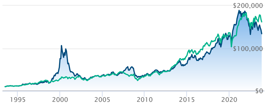
AGF U.S. Small-Mid Cap Fund Mutual Fund Series Dow Jones U.S. Small-Cap TR Index (C$)

The information contained on this page is related only to the designated fund or funds shown above. As part of a BMO Life Assurance Company policy, you do not purchase units in this designated fund or a legal interest in any security.