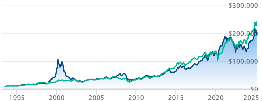
AGF U.S. Small-Mid Cap Fund Mutual Fund Series Dow Jones U.S. Small-Cap TR Index (C$)

The information contained on this page is related only to the designated fund or funds shown above. As part of a BMO Life Assurance Company policy, you do not purchase units in this designated fund or a legal interest in any security.