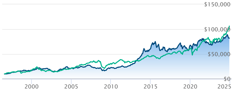
CI Global Health Sciences Corporate Class A S&P/TSX Composite Index TR

The information contained on this page is related only to the designated fund or funds shown above. As part of a BMO Life Assurance Company policy, you do not purchase units in this designated fund or a legal interest in any security.