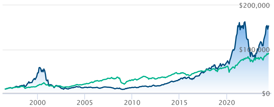
CI Global Alpha Innovators Corporate Class A S&P/TSX Composite Index TR

The information contained on this page is related only to the designated fund or funds shown above. As part of a BMO Life Assurance Company policy, you do not purchase units in this designated fund or a legal interest in any security.