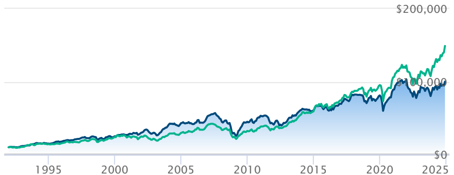
Franklin Royce Global Small Cap Premier Fund Ser A Dow Jones Global Small-Cap TR Index (C$)

The information contained on this page is related only to the designated fund or funds shown above. As part of a BMO Life Assurance Company policy, you do not purchase units in this designated fund or a legal interest in any security.