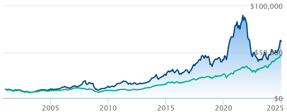
Dynamic Power Global Growth Class Series A Dow Jones Global TR Index (C$)

The information contained on this page is related only to the designated fund or funds shown above. As part of a BMO Life Assurance Company policy, you do not purchase units in this designated fund or a legal interest in any security.