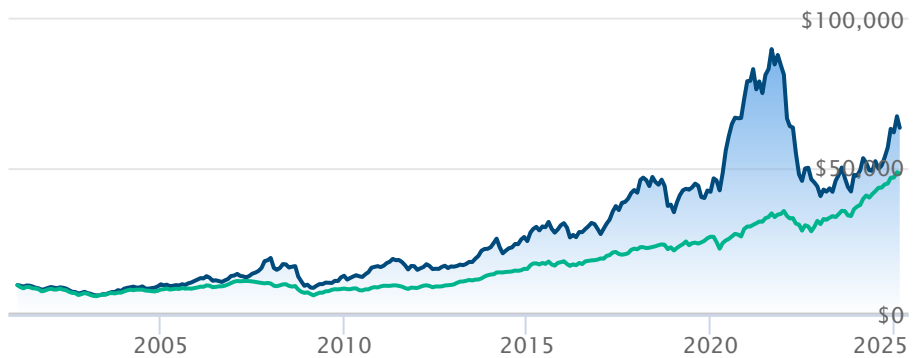
Dynamic Power Global Growth Class Series A Dow Jones Global TR Index (C$)

The information contained on this page is related only to the designated fund or funds shown above. As part of a BMO Life Assurance Company policy, you do not purchase units in this designated fund or a legal interest in any security.