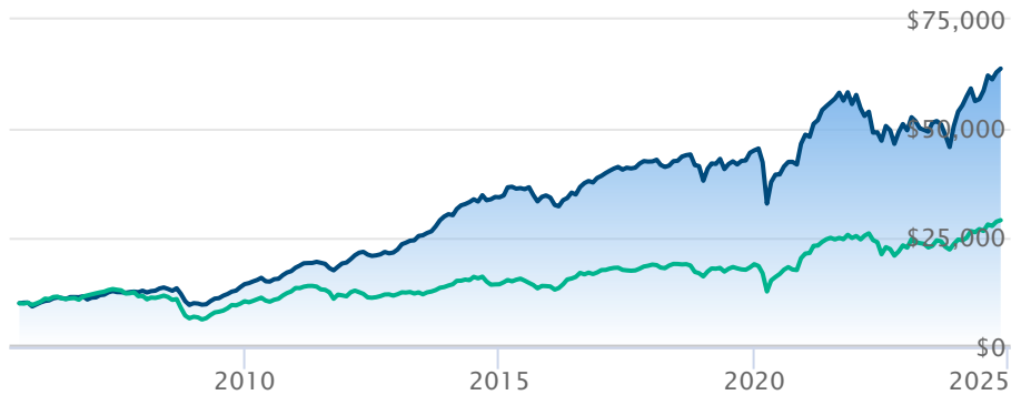
CI North American Small/Mid Cap Equity Fund A Fundata Canadian Focused Small/Mid Cap Equity Indx

The information contained on this page is related only to the designated fund or funds shown above. As part of a BMO Life Assurance Company policy, you do not purchase units in this designated fund or a legal interest in any security.