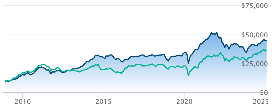
BMO Canadian Small Cap Equity Fund Advisor Series S&P/TSX Smallcap Index TR

The information contained on this page is related only to the designated fund or funds shown above. As part of a BMO Life Assurance Company policy, you do not purchase units in this designated fund or a legal interest in any security.