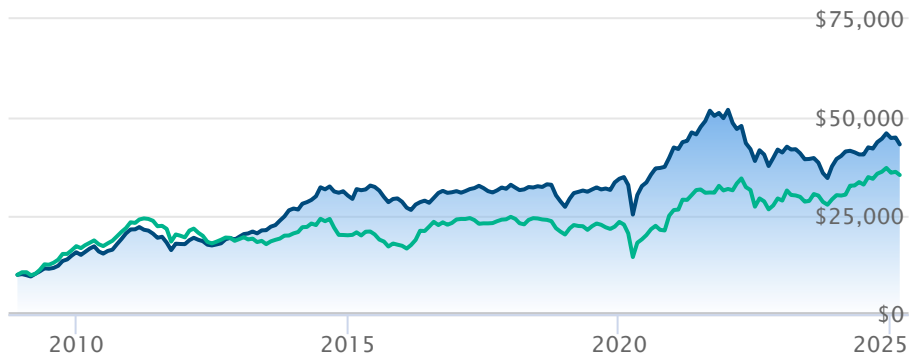
BMO Canadian Small Cap Equity Fund Advisor Series S&P/TSX Smallcap Index TR

The information contained on this page is related only to the designated fund or funds shown above. As part of a BMO Life Assurance Company policy, you do not purchase units in this designated fund or a legal interest in any security.