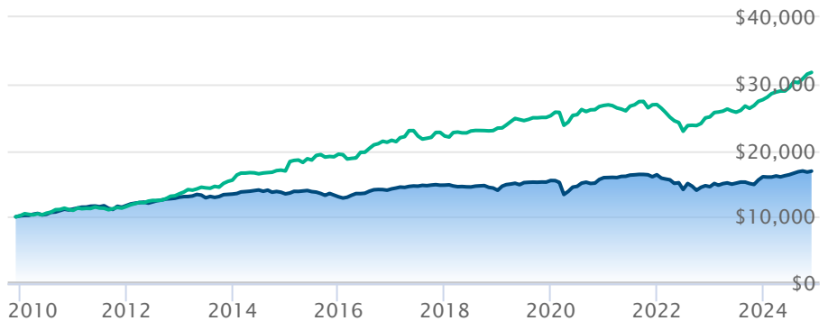
BMO U.S. High Yield Bond Fund Advisor Series ICE BofA Global High Yield Index TR CAD

The information contained on this page is related only to the designated fund or funds shown above. As part of a BMO Life Assurance Company policy, you do not purchase units in this designated fund or a legal interest in any security.