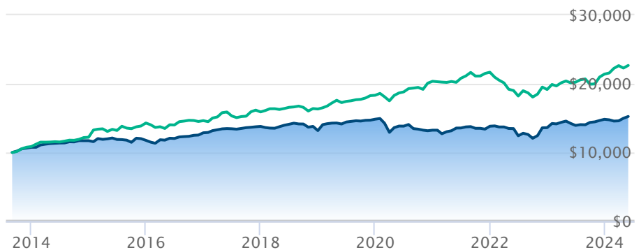
BMO Tactical Dividend ETF Fund Advisor Series Fundata Global Balanced Index

The information contained on this page is related only to the designated fund or funds shown above. As part of a BMO Life Assurance Company policy, you do not purchase units in this designated fund or a legal interest in any security.