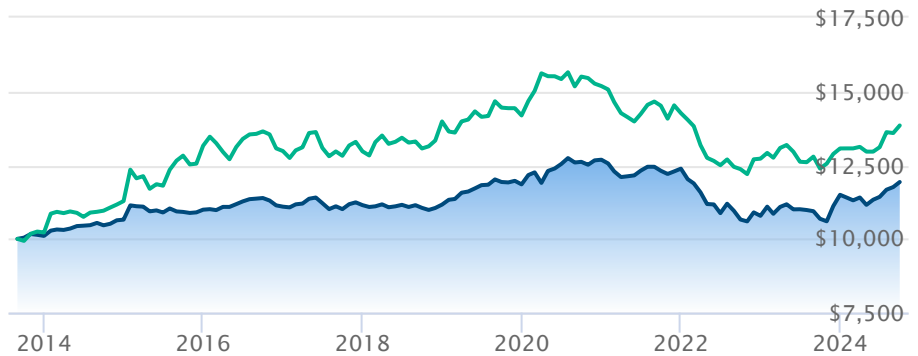
BMO Fixed Income ETF Portfolio Advisor Series ICE BofA Global Broad Market Index TR CAD

The information contained on this page is related only to the designated fund or funds shown above. As part of a BMO Life Assurance Company policy, you do not purchase units in this designated fund or a legal interest in any security.