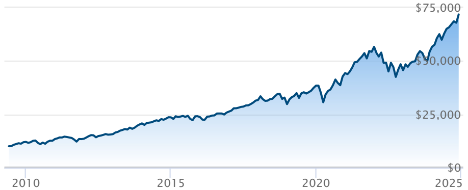
BMO S&P 500 Hedged to CAD Index ETF (ZUE)

Past performance is no guarantee of future performance. All returns are historical annual compounded total rates of return and reflect changes in yield and distributions reinvested. Managed Indexed, Managed Portfolios and Market Indexed accounts credit an interest amount mirroring the net rate of return of a specified underlying investment, less a BMO Life Assurance Company daily management fee. These rates of return do not reflect the current BMO Life Assurance Company management /universal life fee which must be taken into consideration when determining the net return earned on the account.