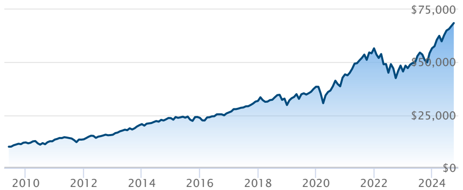
BMO S&P 500 Hedged to CAD Index ETF (ZUE)

Past performance is no guarantee of future performance. All returns are historical annual compounded total rates of return and reflect changes in yield and distributions reinvested. Managed Indexed, Managed Portfolios and Market Indexed accounts credit an interest amount mirroring the net rate of return of a specified underlying investment, less a BMO Life Assurance Company daily management fee. These rates of return do not reflect the current BMO Life Assurance Company management /universal life fee which must be taken into consideration when determining the net return earned on the account.