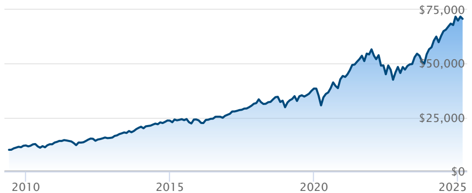
BMO S&P 500 Hedged to CAD Index ETF (ZUE)

Past performance is no guarantee of future performance. All returns are historical annual compounded total rates of return and reflect changes in yield and distributions reinvested. Managed Indexed, Managed Portfolios and Market Indexed accounts credit an interest amount mirroring the net rate of return of a specified underlying investment, less a BMO Life Assurance Company daily management fee. These rates of return do not reflect the current BMO Life Assurance Company management /universal life fee which must be taken into consideration when determining the net return earned on the account.