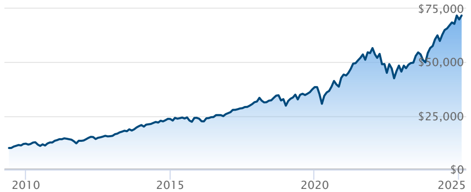
BMO S&P 500 Hedged to CAD Index ETF (ZUE)