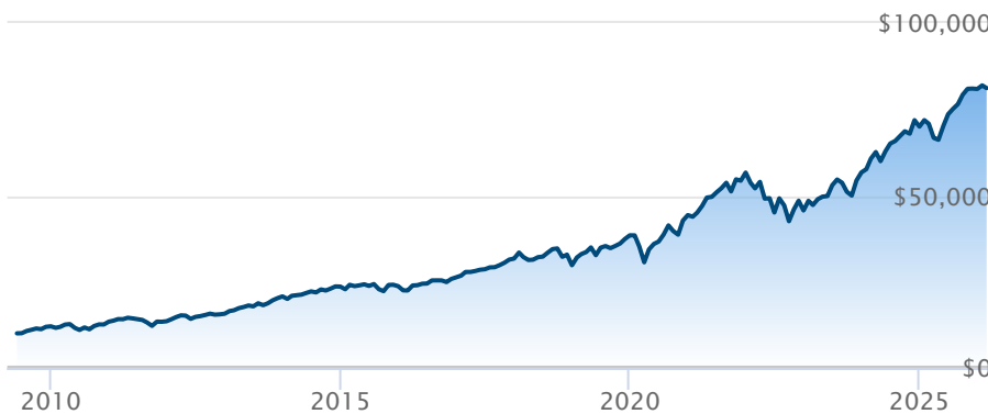
■ BMO S&P 500 Hedged to CAD Index ETF (ZUE)

Past performance is no guarantee of future performance. All returns are historical annual compounded total rates of return and reflect changes in yield and distributions reinvested. Managed Indexed, Managed Portfolios and Market Indexed accounts credit an interest amount mirroring the net rate of return of a specified underlying investment, less a BMO Life Assurance Company daily management fee. These rates of return do not reflect the current BMO Life Assurance Company management /universal life fee which must be taken into consideration when determining the net return earned on the account.