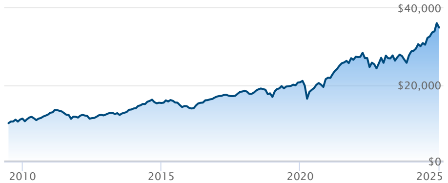
BMO S&P/TSX Capped Composite Index ETF (ZCN)