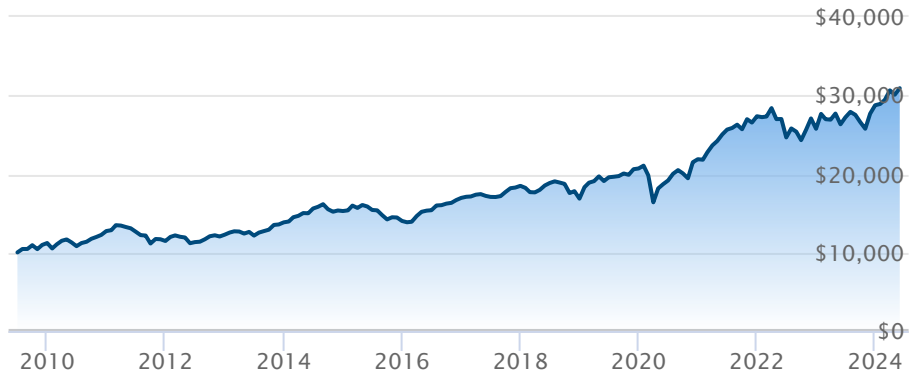
BMO S&P/TSX Capped Composite Index ETF (ZCN)