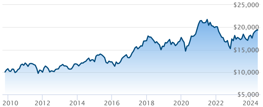
BMO MSCI Emerging Markets Index ETF (ZEM)