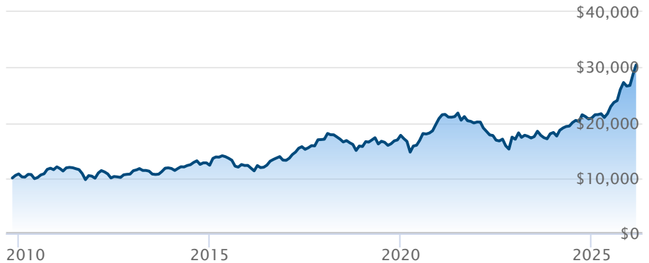
■ BMO MSCI Emerging Markets Index ETF (ZEM)