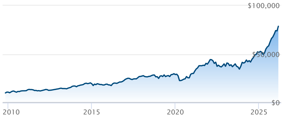
■ BMO Equal Weight Banks Index ETF (ZEB)