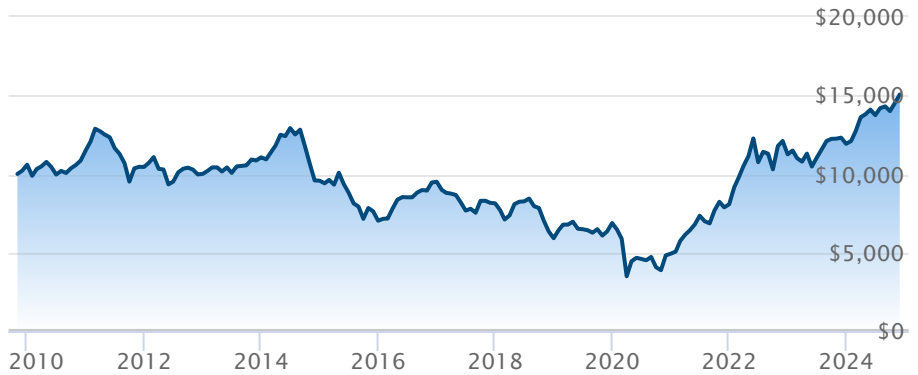
BMO Equal Weight Oil & Gas Index ETF (ZEO)