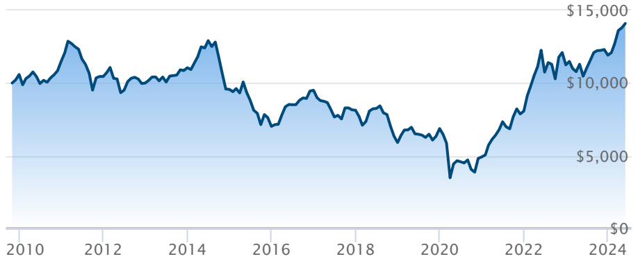
BMO Equal Weight Oil & Gas Index ETF (ZEO)