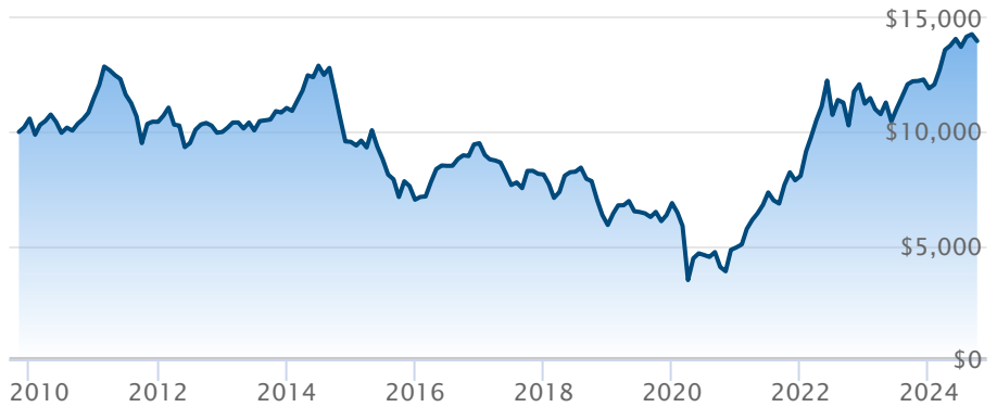
BMO Equal Weight Oil & Gas Index ETF (ZEO)