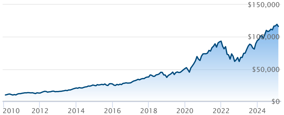
BMO Nasdaq 100 Equity Hedged to CAD Indx ETF (ZQQ)