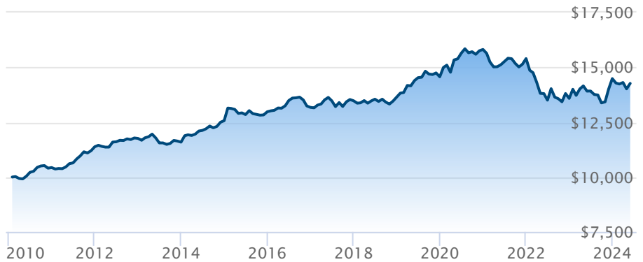
BMO Aggregate Bond Index ETF (ZAG)