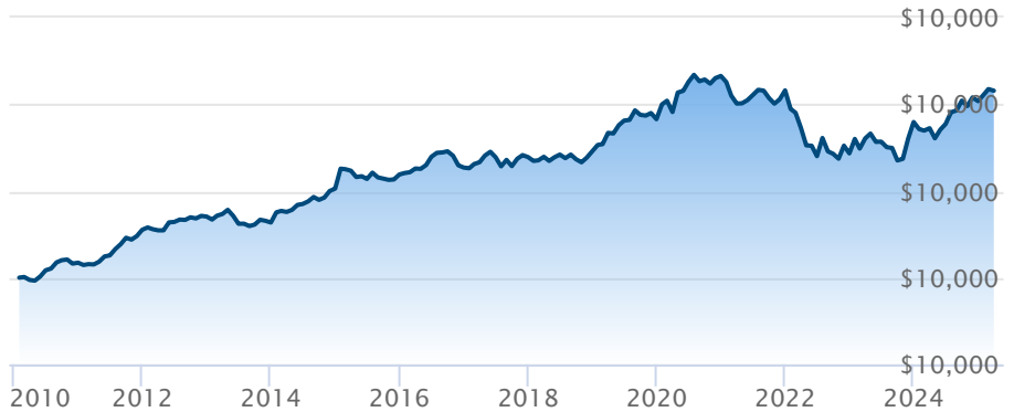
■ BMO Aggregate Bond Index ETF (ZAG)