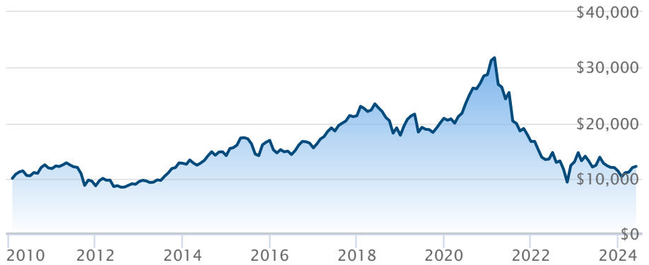
BMO MSCI China ESG Leaders Index ETF (ZCH)