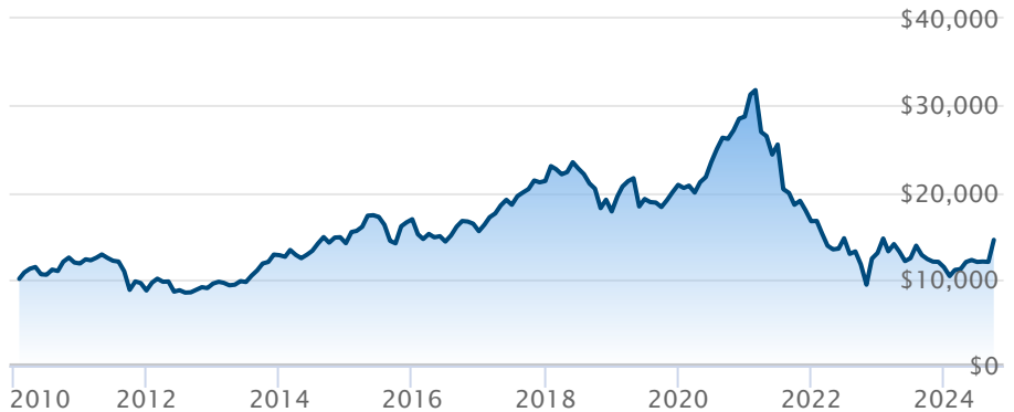
BMO MSCI China ESG Leaders Index ETF (ZCH)