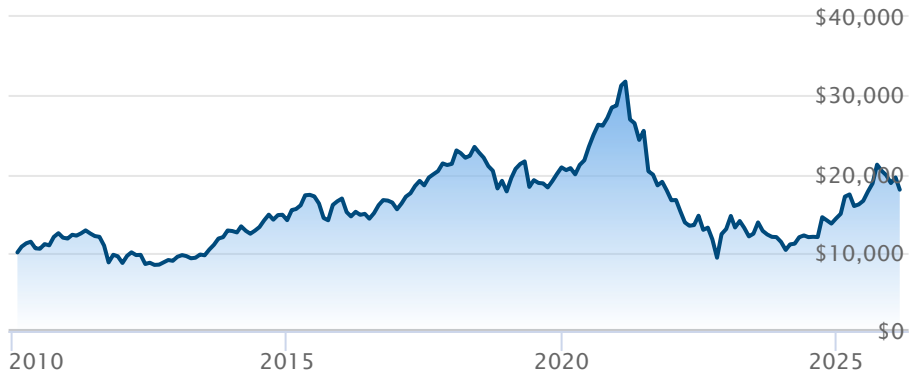
■ BMO MSCI China Selection Equity Index ETF (ZCH)