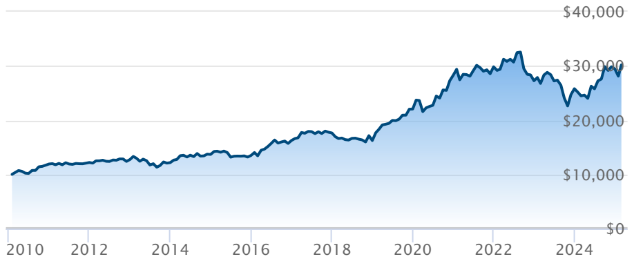
BMO Equal Weight Utilities Index ETF (ZUT)