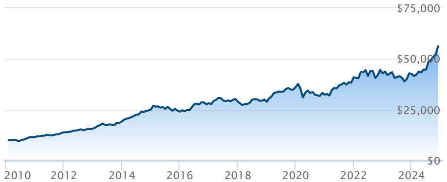
BMO Global Infrastructure Index ETF (ZGI)