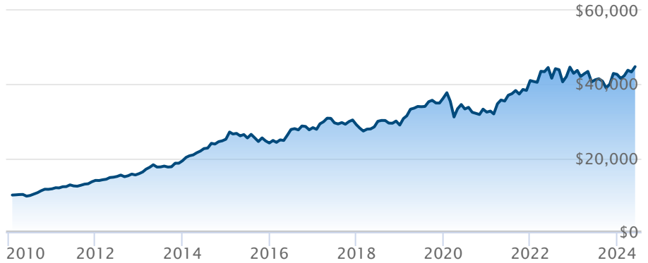
BMO Global Infrastructure Index ETF (ZGI)