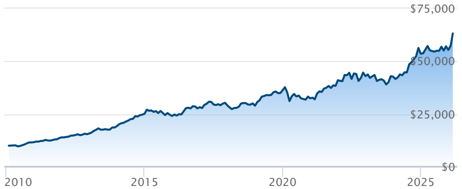
■ BMO Global Infrastructure Index ETF (ZGI)