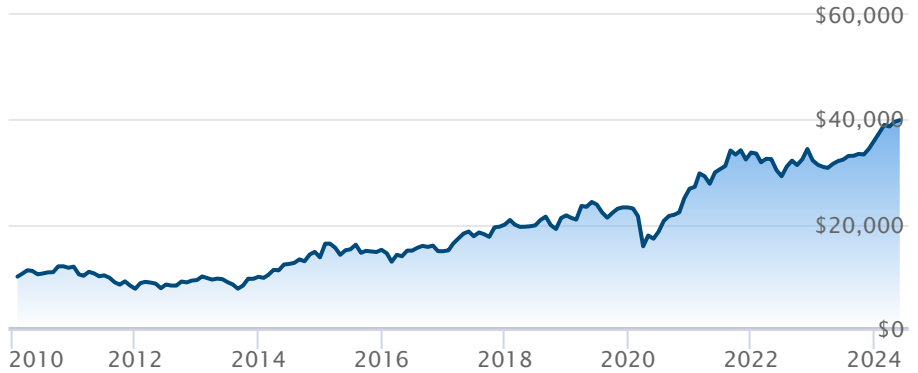
BMO MSCI India ESG Leaders Index ETF (ZID)