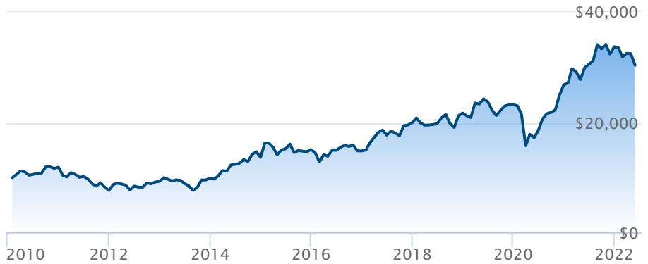
■ BMO MSCI India ESG Leaders Index ETF (ZID)