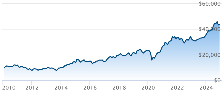
BMO MSCI India ESG Leaders Index ETF (ZID)