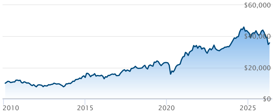
■ BMO MSCI India Selection Equity Index ETF (ZID)