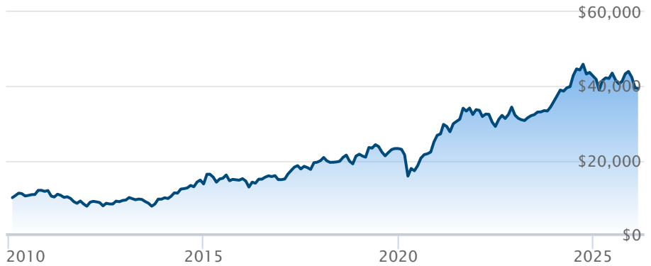
■ BMO MSCI India Selection Equity Index ETF (ZID)