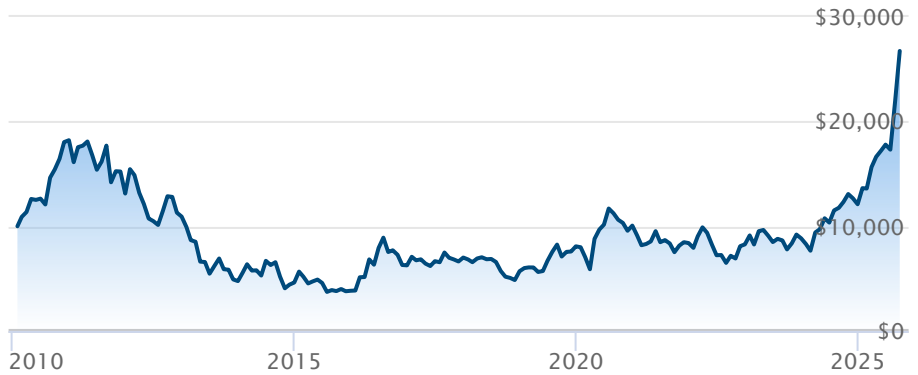
■ BMO Junior Gold Index ETF (ZJG)