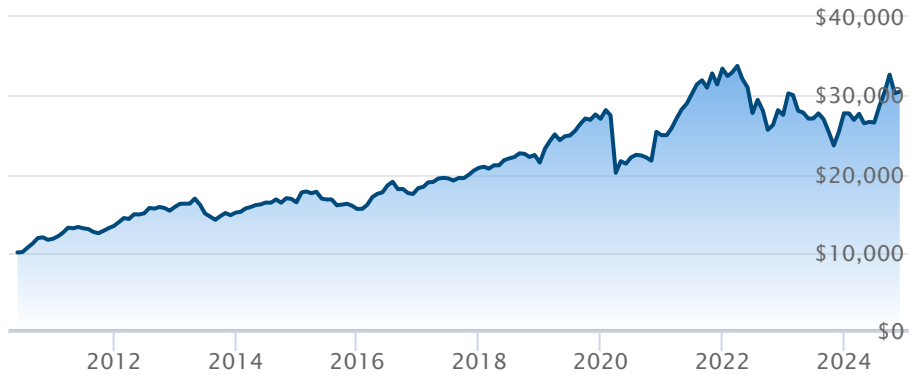
BMO Equal Weight REITs Index ETF (ZRE)