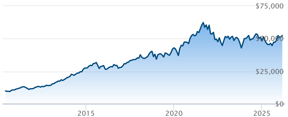
■ BMO Equal Weight US Health Care Hgd to CAD (ZUH)