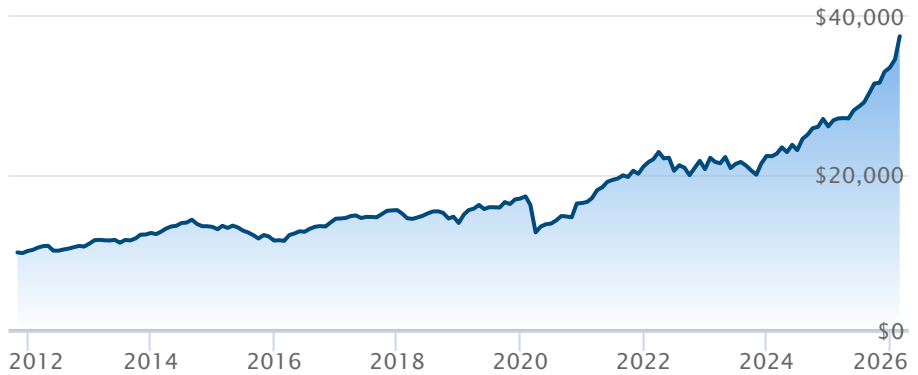
■ BMO Canadian Dividend ETF (ZDV)