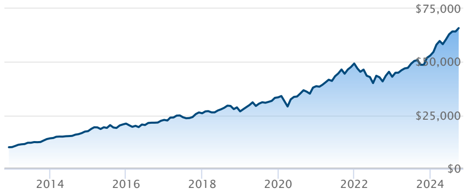
BMO S&P 500 Index ETF (ZSP)