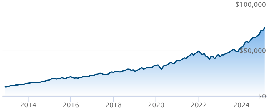
BMO S&P 500 Index ETF (ZSP)