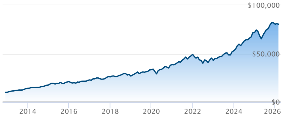
■ BMO S&P 500 Index ETF (ZSP)