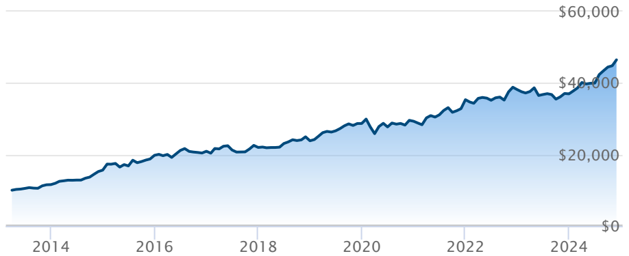
BMO Low Volatility US Equity ETF (ZLU)