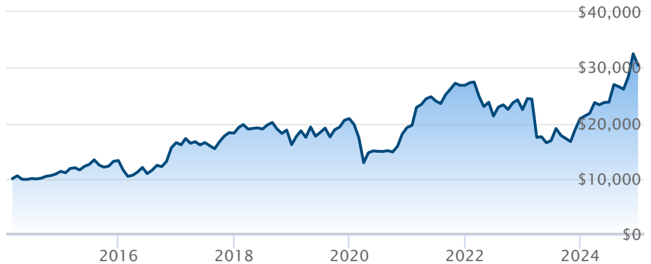
BMO Equal Weight US Banks Index ETF (ZBK)