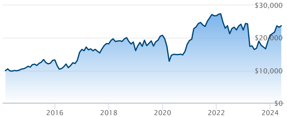
BMO Equal Weight US Banks Index ETF (ZBK)