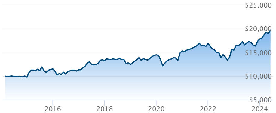
BMO MSCI EAFE Index ETF (ZEA)