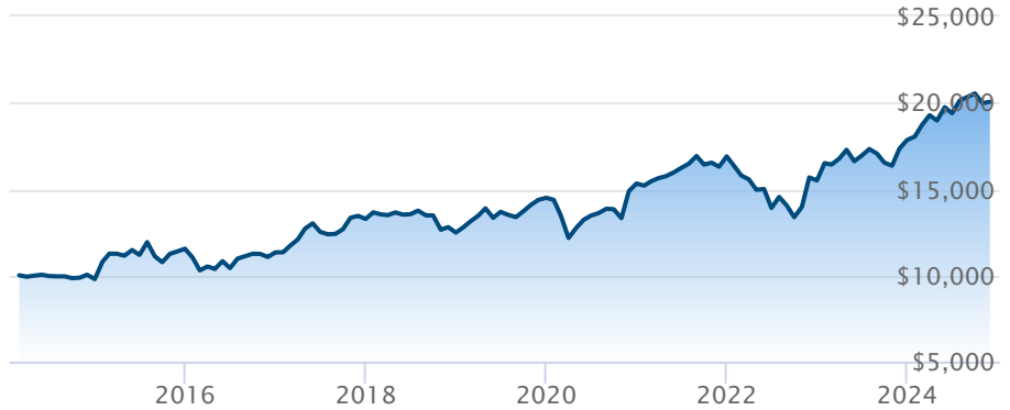
BMO MSCI EAFE Index ETF (ZEA)