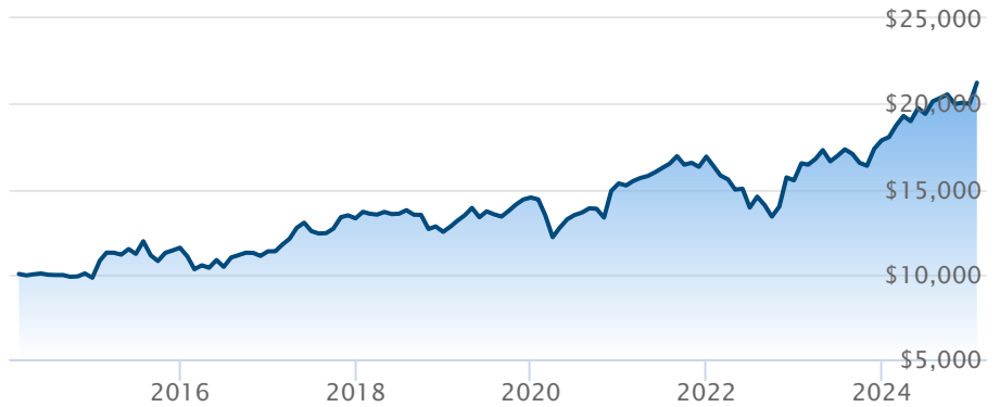
BMO MSCI EAFE Index ETF (ZEA)