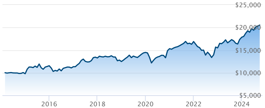
BMO MSCI EAFE Index ETF (ZEA)