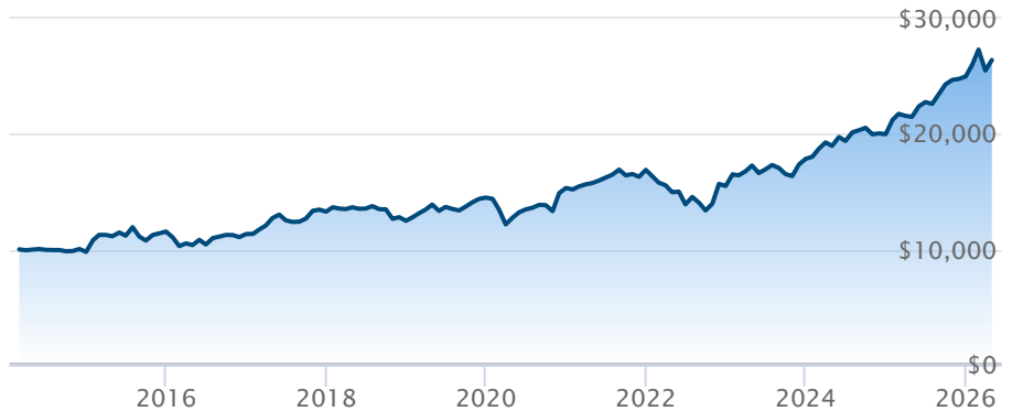
■ BMO MSCI EAFE Index ETF (ZEA)