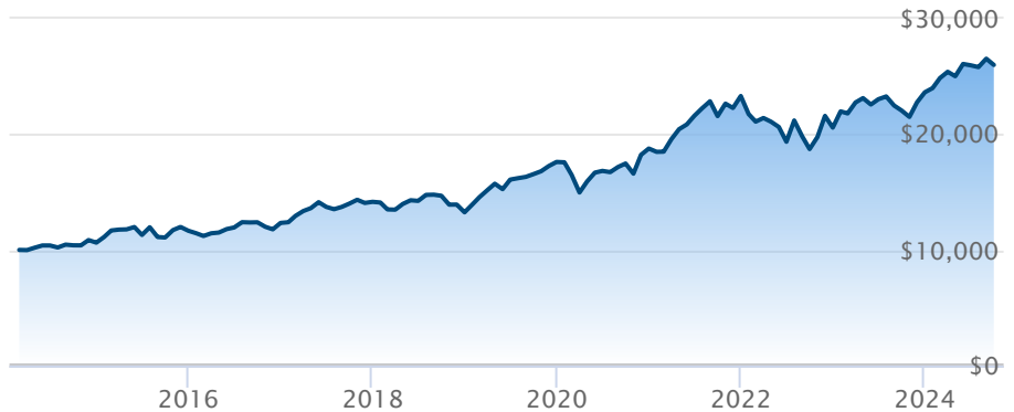
BMO MSCI Europe High Quality Hgd C$ Idx ETF (ZEQ)