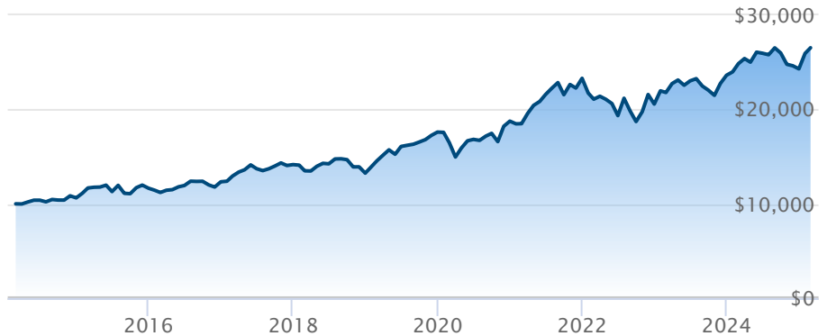
BMO MSCI Europe High Quality Hgd C$ Idx ETF (ZEQ)