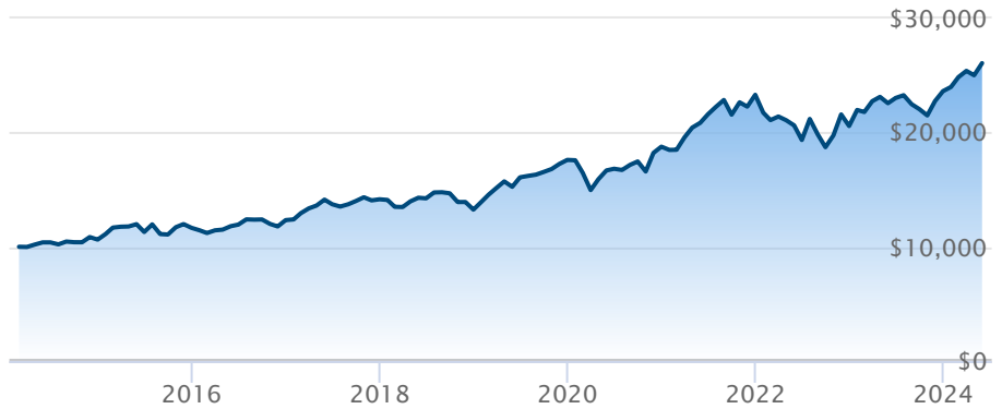
BMO MSCI Europe High Quality Hgd C$ Idx ETF (ZEQ)