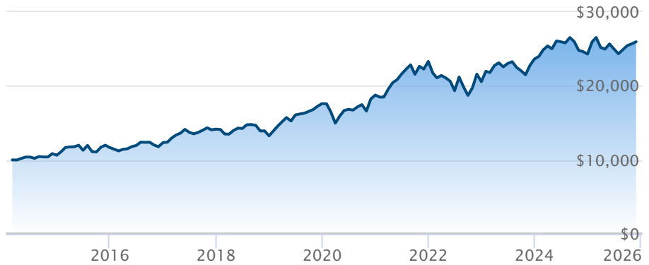
■ BMO MSCI Europe High Quality Hgd C$ Idx ETF (ZEQ)