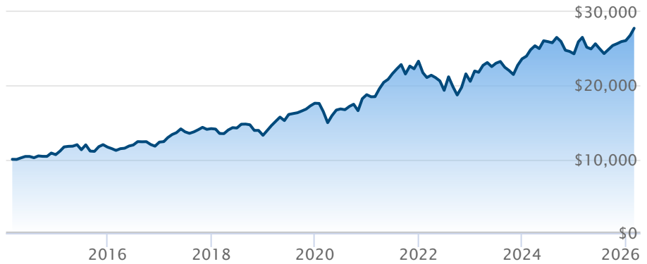
■ BMO MSCI Europe High Quality Hgd C$ Idx ETF (ZEQ)