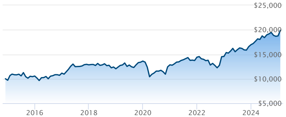
BMO International Dividend ETF (ZDI)