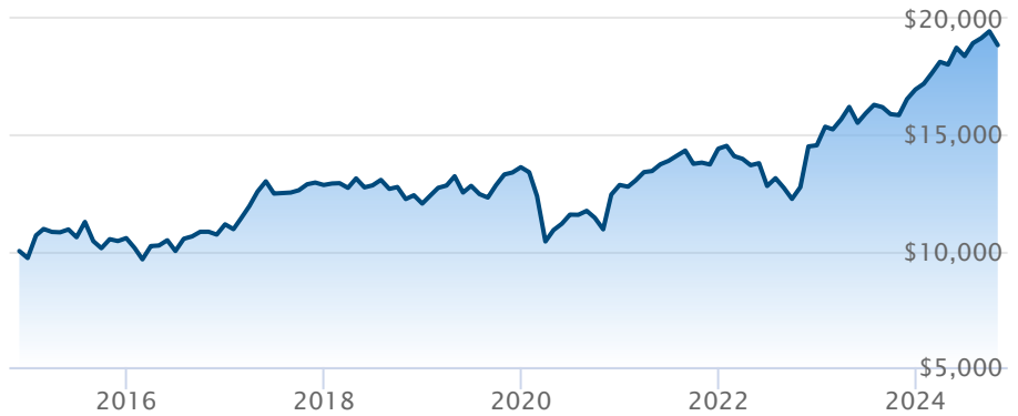
BMO International Dividend ETF (ZDI)