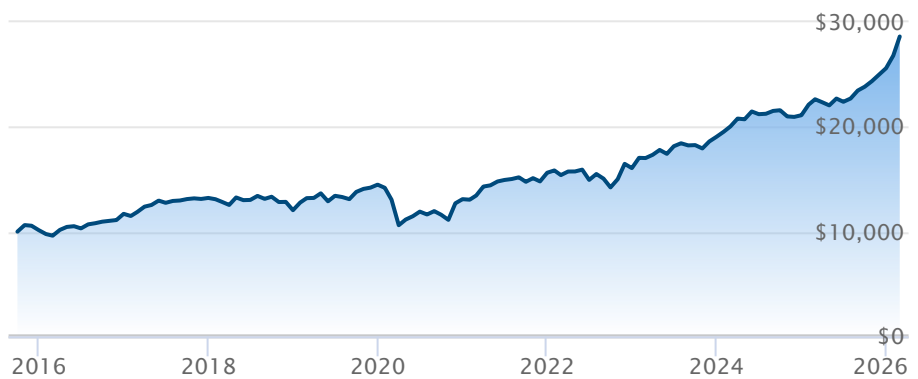
■ BMO International Dividend Hedged to CAD ETF (ZDH)