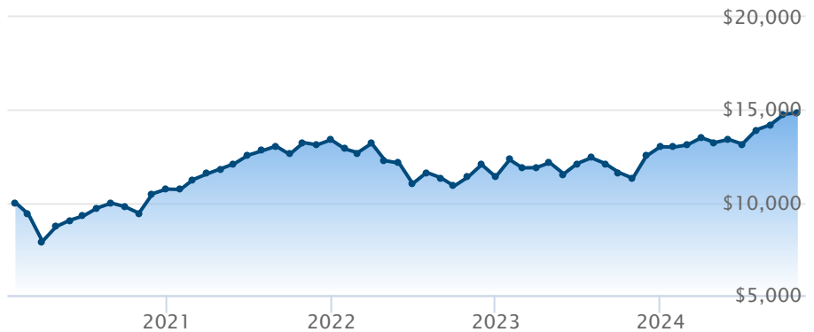
BMO MSCI Canada ESG Leaders Index ETF (ESGA)