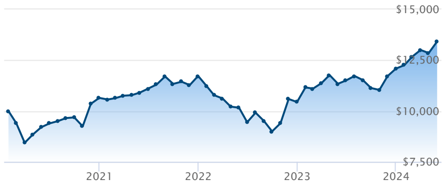
BMO MSCI EAFE ESG Leaders Index ETF (ESGE)