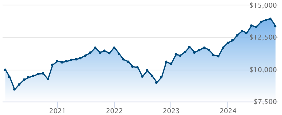
BMO MSCI EAFE ESG Leaders Index ETF (ESGE)