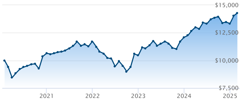
BMO MSCI EAFE Selection Equity Index ETF (ESGE)