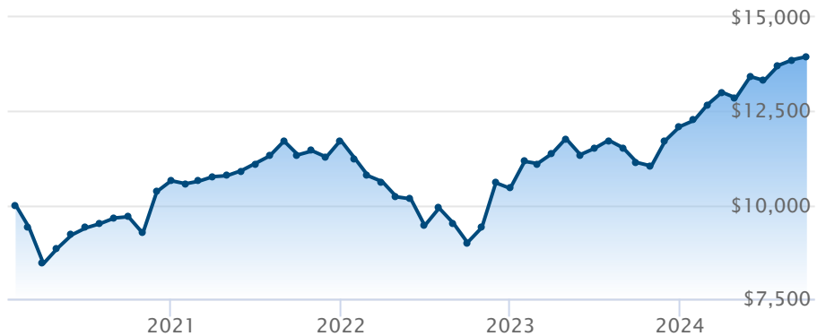
BMO MSCI EAFE ESG Leaders Index ETF (ESGE)