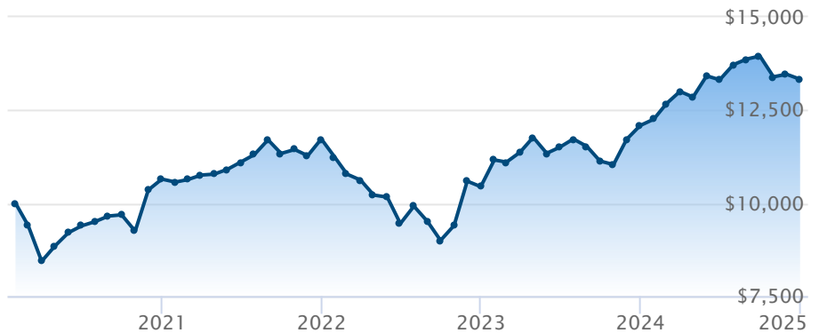
BMO MSCI EAFE ESG Leaders Index ETF (ESGE)