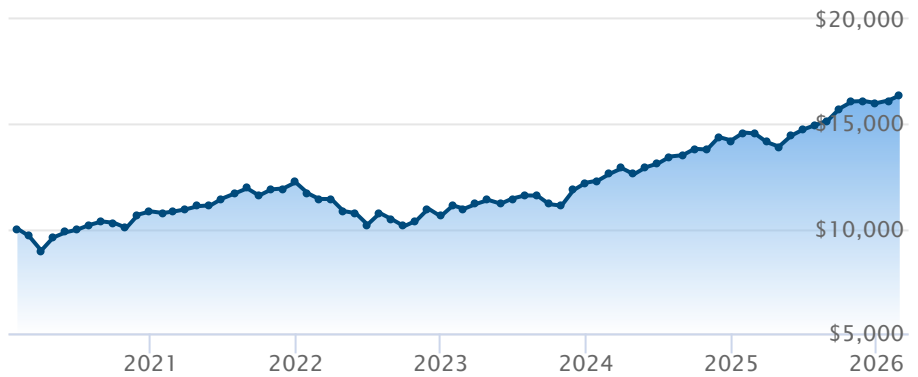
■ BMO Balanced ESG ETF (ZESG)