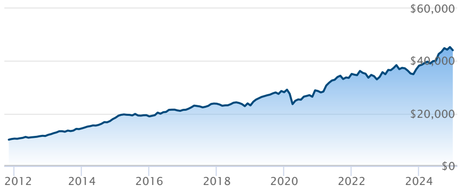
BMO Low Volatility Canadian Equity ETF (ZLB)